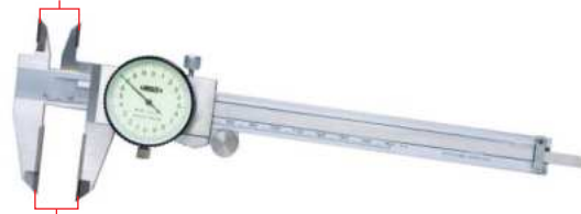
carbide measuring faces 1339-150